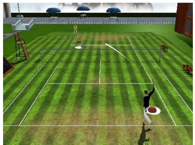
Figure 1. Tennis game engine.

As a vehicle for the experiments, we use a custom-designed tennis game engine, developed with Unity3D [2] (see Figure 1).