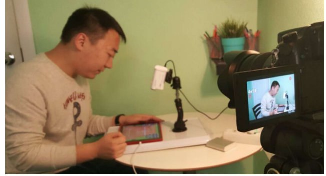
Figure 4. Usability testing.

We think this system is technologically the most advanced testing mechanism in our daily use. It certainly has numerous flaws: mobile devices require maintenance, and each device might need to be configured in a specific way; Appium and operating system updates sometimes break compatibility,