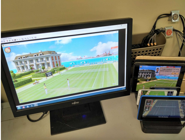
Figure 3. Mobile testing farm.

your character's skills using available experience points; 4) link your Facebook account to the game; 5) change current club / character / clothes / equipment.